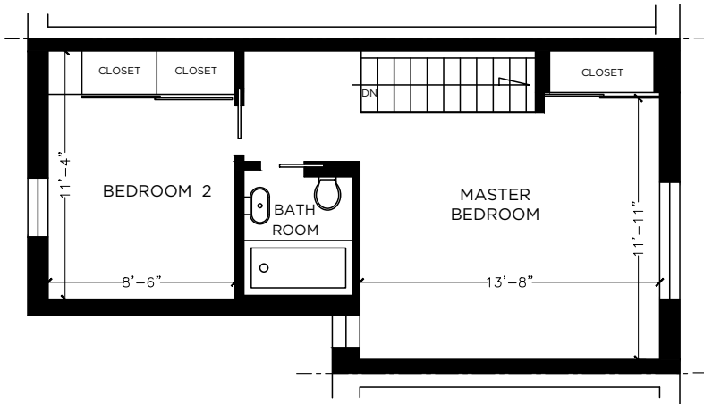
SECOND FLOOR FLOOR AREA 414 SQUARE FEET