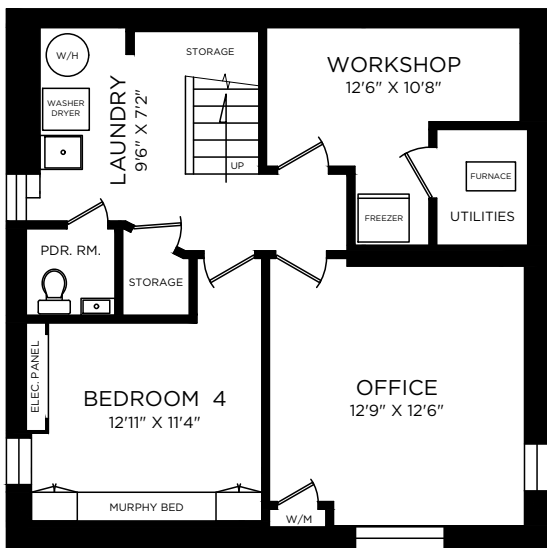
BASEMENT APPROX. 709 SQ. FT.