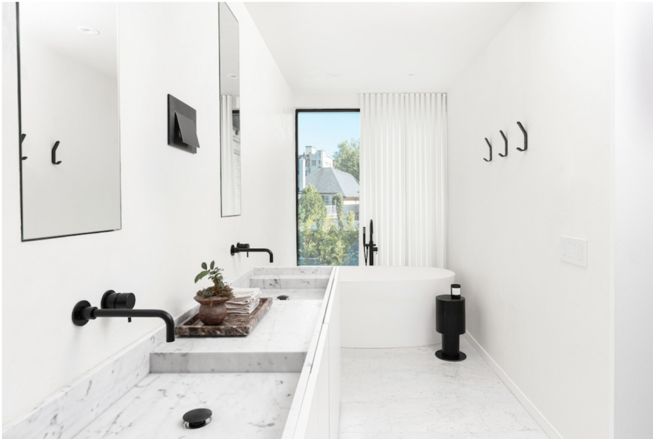
It comes with double marble sinks, a soaker tub and walk-in shower.